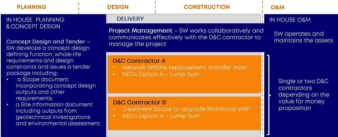
The Preferred D&C Procurement Model

This project will be tendered as two packages, incorporating the treatment and network elements of scope via collaborative design and construct (D&C) contracts. Both elements will be procured as separate transactions with the option to combine if necessary.