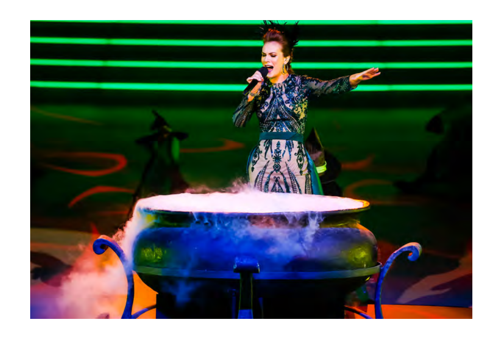
Large scale props

Props such as handheld torches and novelty items for the massed choir to create effects during the live show. Supporter acknowledged in program.